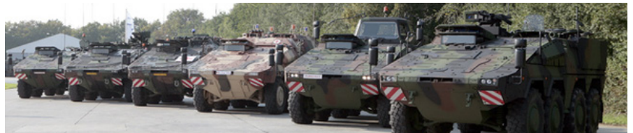
▲ Deform manufactures several formed protective plates for Boxer, the new, highly flexible, modular vehicle system.