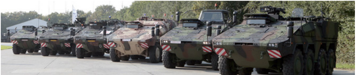
▲ Deform manufactures several formed protective plates for Boxer, the new, highly flexible, modular vehicle system.

We feel there is great potential for further developing such collaborations. The possibilities include not only individual, 3-dimensionally formed plates, but also complete system deliveries that may even involve welding and assembly.