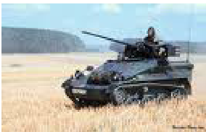
▲ Deform manufactures hatches to Wiesel.