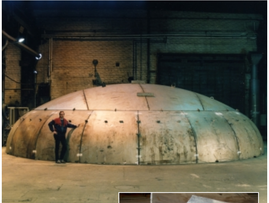
Patrik Molin in front of a 12,5 meter in diameter segment head.

This delivery strengthens our top position in the area advanced forming of stainless steel products. The customers are acting in many different fields and Deform is mainly aiming for really thick plate sizes. The thicker, the more advanced – the better!