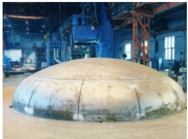
Segment head with diameter 6,3 meter.