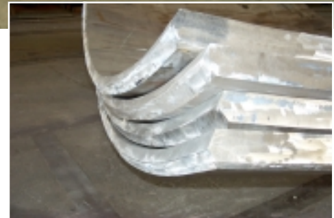
52 mm thick Duplex.