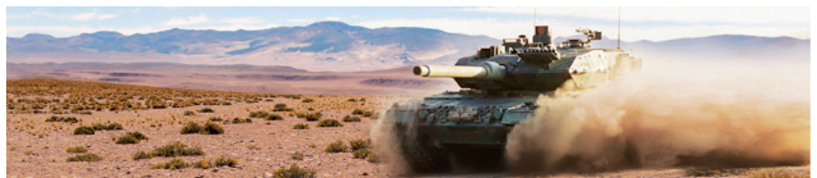
▲ Deform manufactures a bottom plate, a front plate and two side plates for all Leopard battle tanks.