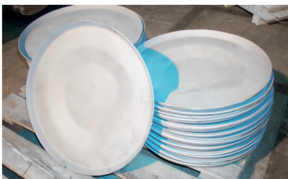
▲ Hatch in 500HB steel for KMW's LeFlaSys.