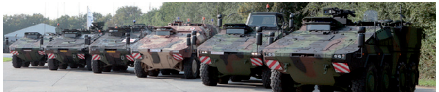
▲ Deform manufactures several formed protective plates for Boxer, the new, highly flexible, modular vehicle system.